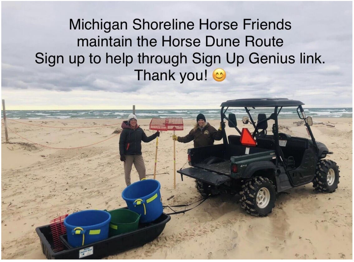
Volunteersign up link: https://www.signupgenius.com/go/10C0E49ADA72EA4F8C70-michigan